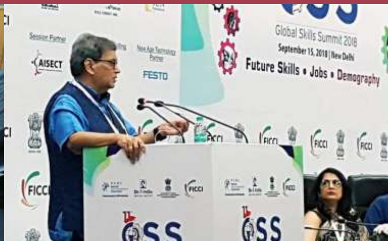
Subhash Ghai, Chairman, MESC at Global Skills Summit 2018.